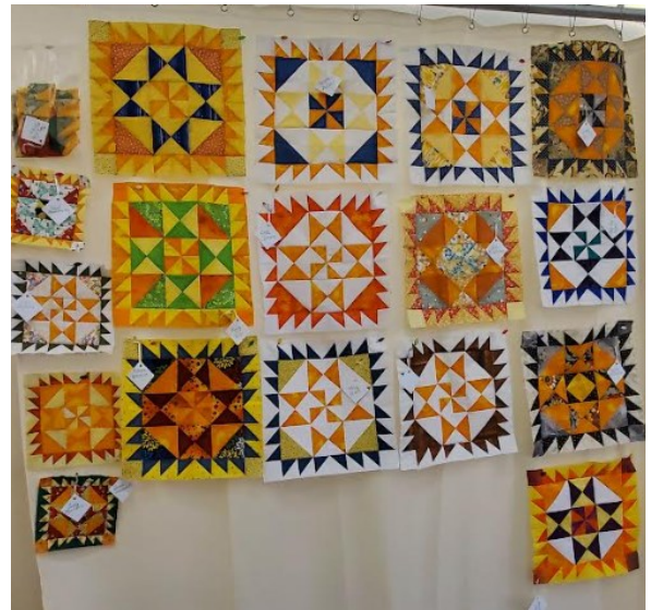
November Mtg BOM